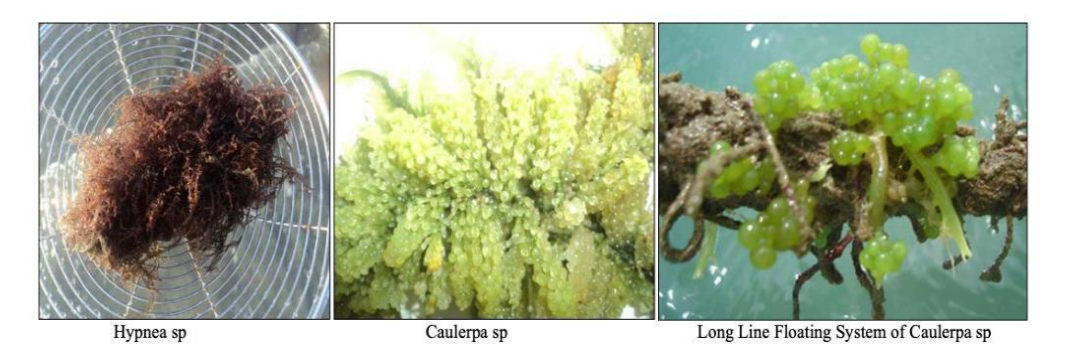
Figure 3: Some identified seaweeds from St. Martin Island and Coxs bazar

In the coastal area of Bangladesh 193 seaweed varieties have been identified. Out of 193 varieties, 14 varieties turned out to be commercially important. Although seaweeds have been consumed and considered as a source of earning foreign currency in many Asian countries, the scenario of seaweeds exploitation and utilization is quite opposite in Bangladesh. Other than some tribal people the utilization of seaweeds are almost nil in rest of the country. [Majumder, 2010, Sarkar, 2016]. Recently government and some private organizations have taken some initiatives to utilize seaweeds [DoF, 2014, COAST Trust, 2013].